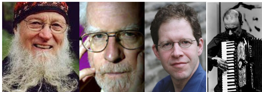
Terry Riley Frank Corcoran Thomas Whitman Bill Schimmel

Quasi Una Storia Brightness Aloft Halfwolf Dances Mad in Moonlight Max to Max Anniversary Fanfare